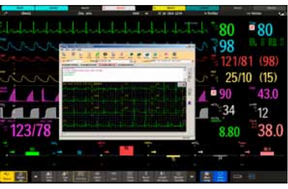
Access previous ECGs from Philips TraceMasterVue or other ECG management systems.