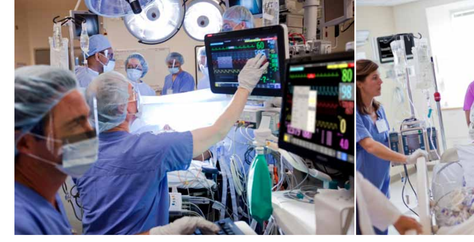
Connectivity with a wide range of devices such as anesthesia machines and IV pumps.