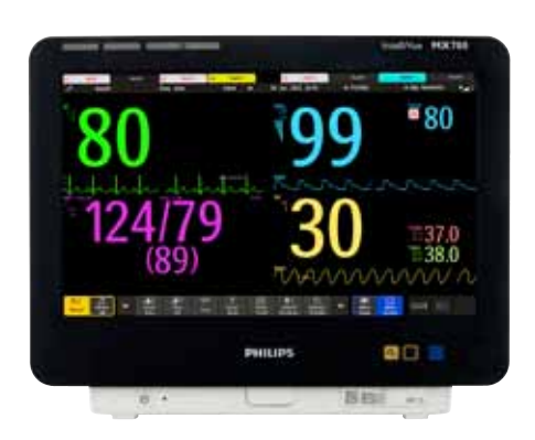
Philips IntelliVue MX600 has a 15" widescreen with Navigation Point control, and can also be operated by remote control.