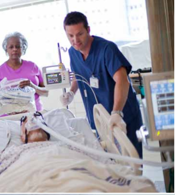
Compatible with currently installed IntelliVue monitors, such as the IntelliVue X2 for patient transport.

Integrates easily into your wired or wireless environment and supports your IT policies and processes.