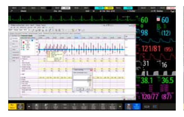
Show patient flow sheet from critical care information system (Philips ICIP).

IntelliVue MX patient monitors combine world-class Philips monitoring and – with the iPC option – clinical informatics through the hospital network at the bedside.