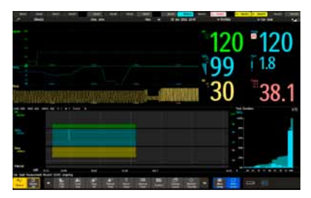
Car seat testing, recommended by the American Academy of Pediatrics, helps clinicians to assess neonates' ability to safely tolerate the car trip home.