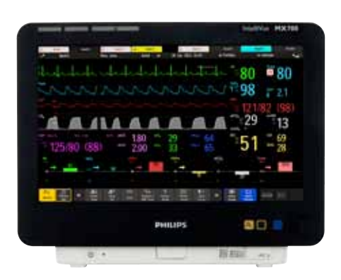
Philips IntelliVue MX700 offers a wide 15" touchscreen , and can also be operated by Navigation Point control or remote control.