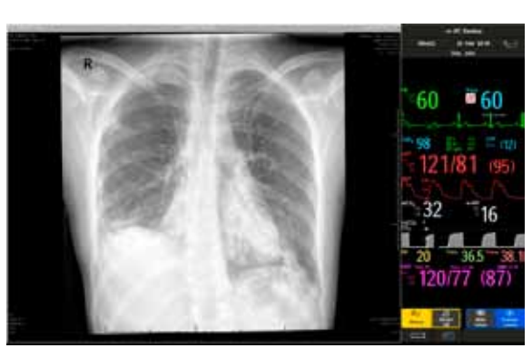
Leverage relevant information from your PACS.