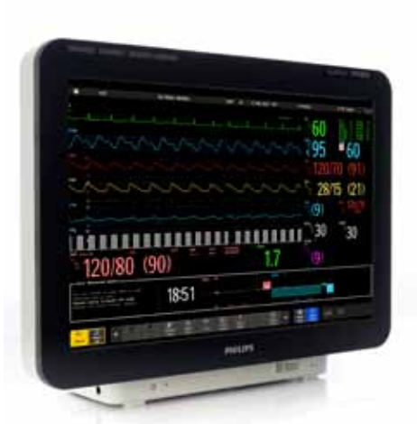
Philips IntelliVue MX800 features a 19" panoramic touchscreen and can also be operated by remote control.